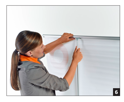
Fix the upper clamping rail from the print in place using your hand and insert the telescopic rod into the centre plastic clip of the clamping rail.