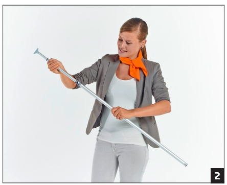
Loosen the individual pieces of the telescopic rod, separate them and then retighten them. You can also just extend the telescopic rod at the end using the attached clamping rail, so you don't need to use a stepladder or stool.