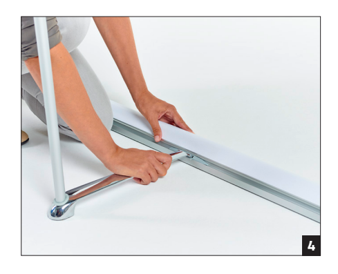
Insert the base into the centre plastic clip of Carefully unroll the print. the lower clamping rail of the print.