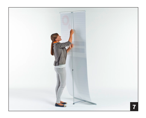
Now you can fully extend the telescopic rod Here is your L-banner in full size. upwards, until the print is fully stretched. Loosen the parts of the telescopic rod that have not yet been extended, separate them and then retighten them.