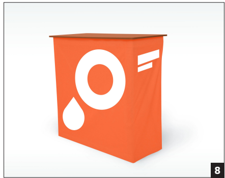
Here is your textile exhibition counter in full size.

Place the tabletop on the system. Make sure that the Velcro spots on the counter and tabletop are properly aligned over one another in order to prevent the tabletop from slipping.