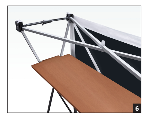
Place the bottom insert facing upwards in the frame.