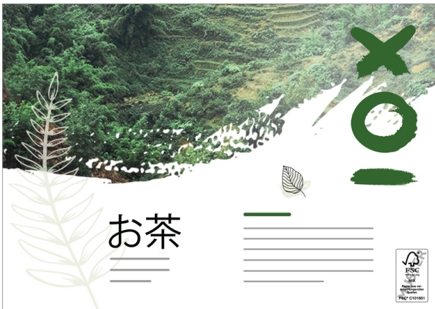
FSC® label placement: front, bottom right

FSC® label (31 x 49 mm) The FSC® label still has a 2 mm white space all around. Please choose whether the FSC® label should be placed on the front, back, bottom left, or bottom right.